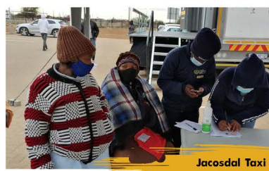
Jacosdal Taxi Rank 8 June 2021