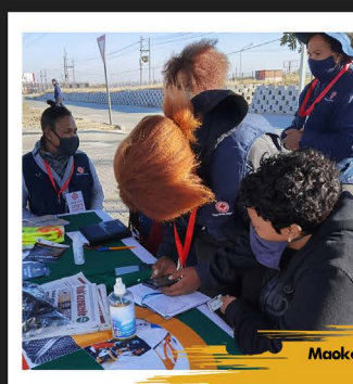
Maokeng Mall, Kroonstad 12 June 2021