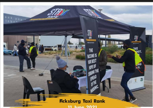
Ficksburg Taxi Rank 11 June 2021