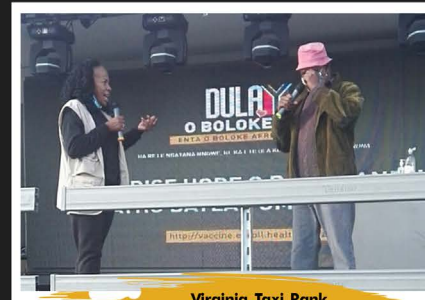
Virginia Taxi Rank 11 June 2021