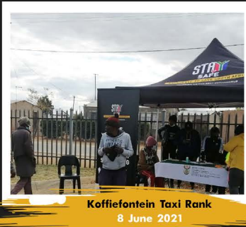
Koffiefontein Taxi Rank 8 June 2021